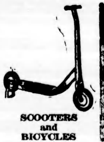
SCOOTERS and BICYCLES