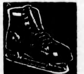
ICE SKATES and HOCKEY EQUIPMENT